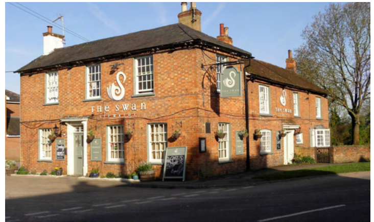
The Old Swan Inn- the Keep

The plan for village defence was to be centred on a central point or keep, designated as The Old Swan Inn. This was to be sand-bagged and trenches dug all around.