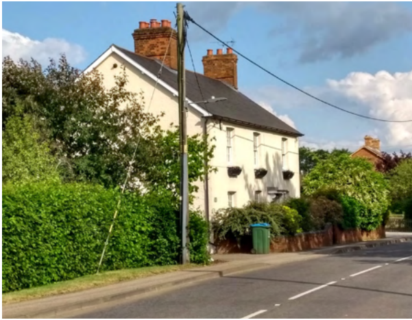
The Bleak House blockhaus guarding the North End

ponds would soon run dry in summer. Emergency stocks of toilet paper were purchased, and emergency latrines were to be dug by volunteer labour.