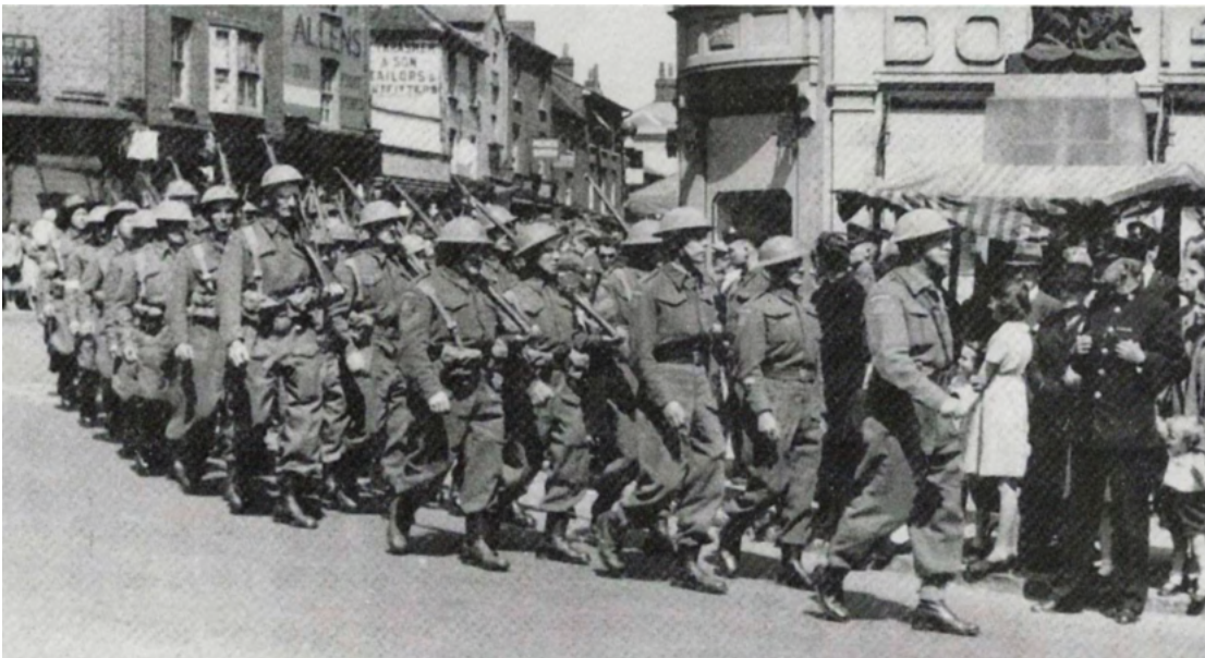
Buckinghamshire Battalion Home Guard 1942

The supply of water and sanitation naturally preoccupied lots of local folks. Although mains water came through Stewkley in 1941, in the event of disruption to supply it would be necessary to revert to the remaining village pumps and wells, as